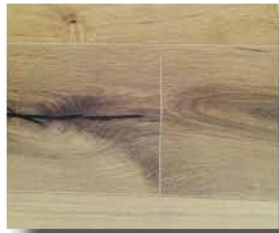
1801 - Poloma