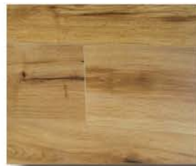
1802 - Monterey