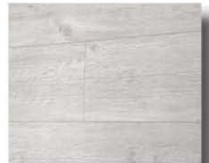
1806 - Dove