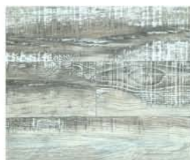
1808 - Antico