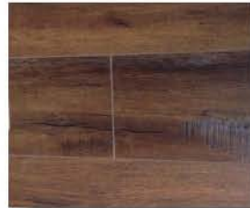
1805 - Cognac