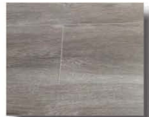
1803 - Soho Grey