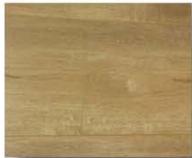
1804 - Toffee