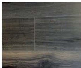
1807 - Wenge