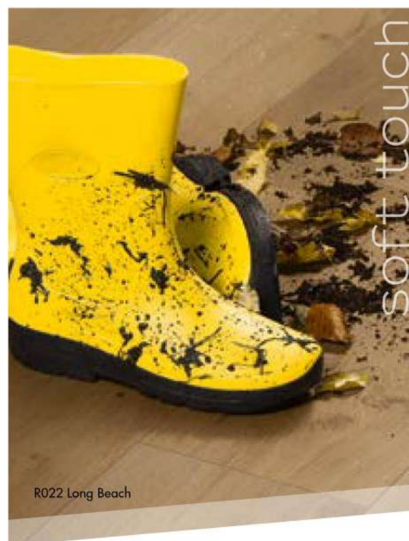
R022 Long Beach