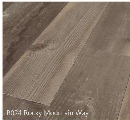
R024 Rocky Mountain Way