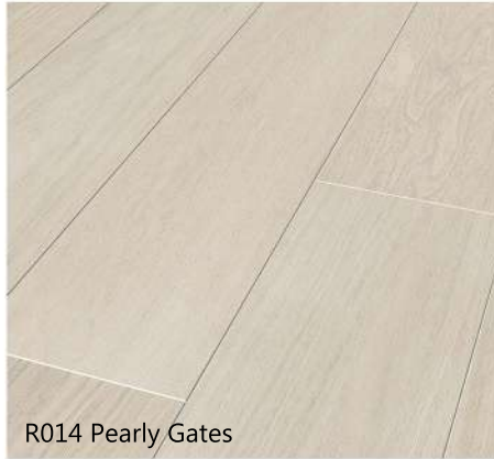
R014 Pearly Gates