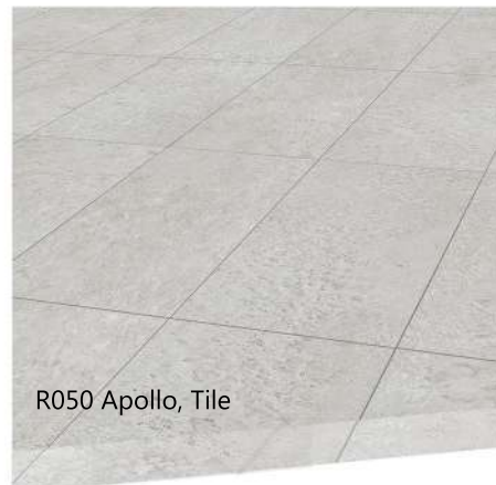
R050 Apollo, Tile