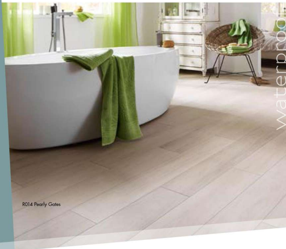
R014 Pearly Gates

Krono Xonic was subjected to long-term, comprehensive testing and we are proud of the results. These not only relate to quality and user-friendliness but with the vinyl itself, directly to its impact on the environment. Krono Xonic can be fully recycled. Ten international patents protect the product design and technology.