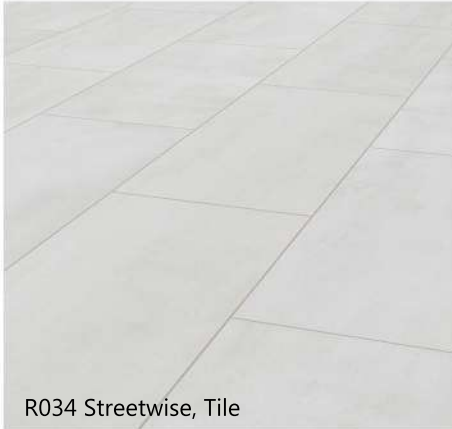
R034 Streetwise, Tile